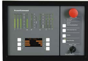
Optional features shown